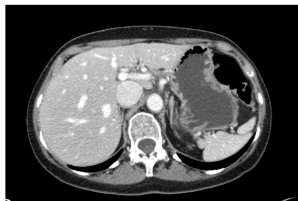
Fig. 3 Complete response. In January 2014, CT scan showed a complete response of liver metastases

Currently, these treatments (capecitabine plus vinorelbine and dasatinib) are still ongoing with a PFS of 54 months and good tolerance.