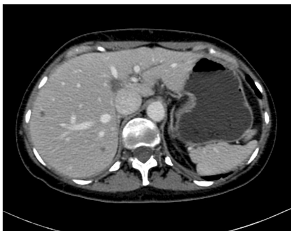
Fig. 1 Hepatic lesions. In July 2011, CT scan showed occurrence of hepatic lesions

In August 2011, she started a second line chemotherapy with nab-paclitaxel 260 mg/m 2 3 weekly supported with granulocyte colony stimulating factor (GCSF); stopping dasatinib for 6 days during the administration of GCSF, as for hematological counseling. The treatment has been continued for 16 cycles with a stable disease (SD) as a best response. In October 2012, after a total of 14 months of therapy, a CT scan showed liver progression with the appearance of a 11 mm new lesion in IVb segment (Fig. 2), thus she started a third line